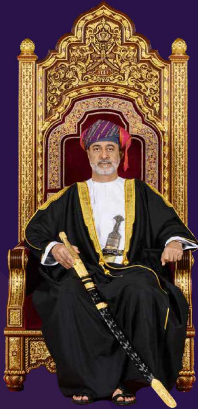
His Majesty Sultan Haitham bin Tarik